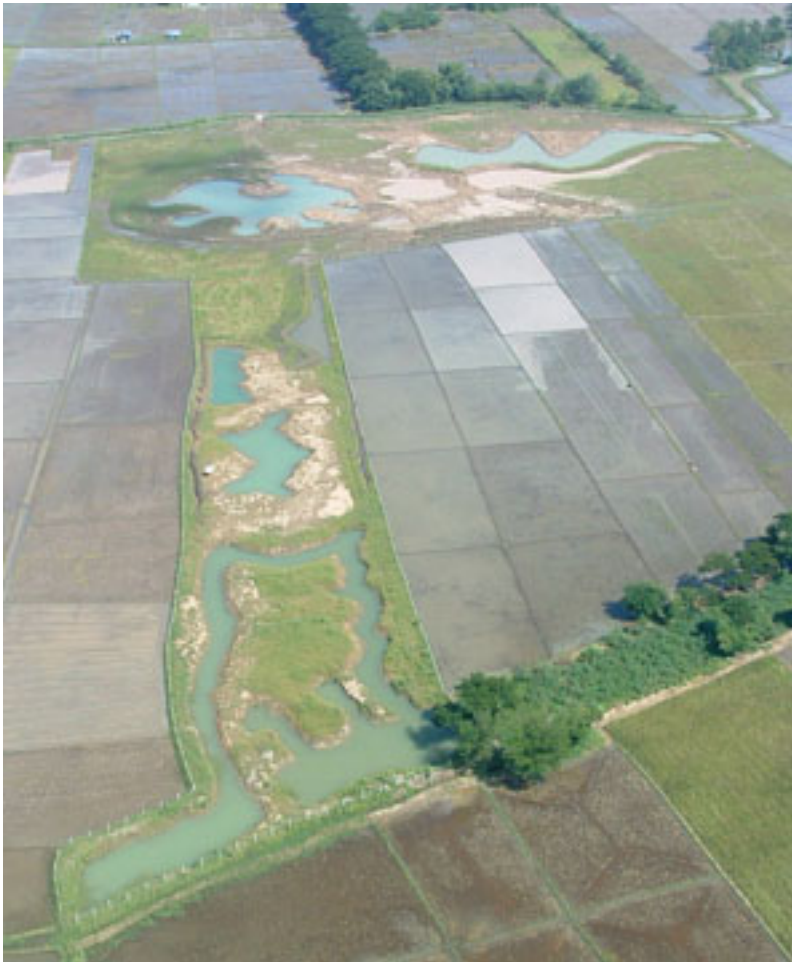
An ariel view of Pintig Ecovillage land (top is being financed by grants, the team will do, and, that is the area