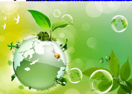
Figure 3: An artistic view of a ideal environment.