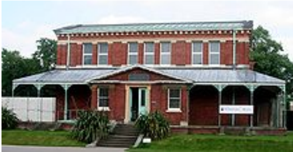
The Marianne North Gallery of Botanic Art

The Marianne North Gallery was built in the 1880s to house the paintings of Marianne North, an MP's daughter who travelled alone to North and South America, South Africa and many parts of Asia, at a time when women rarely did so, to paint plants. The gallery has 832 of her paintings. The paintings were left to Kew by the artist and a condition of the bequest is that the layout of the paintings in the gallery may not be altered.