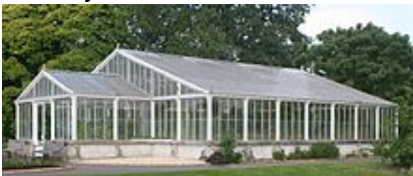
The Waterlily House

The Waterlily House is the hottest and most humid of the houses at Kew and contains a large