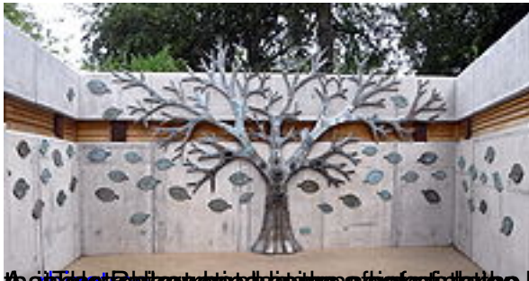
Inside the Temperate House

Saturday, 12 November 2016 22:46 - Last Updated Saturday, 12 November 2016 23:07