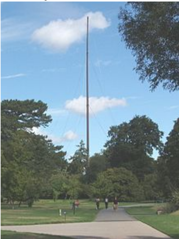
The flagpole at Kew Gardens, which stood from 1959 until 2007

Kew, the area in which Kew Gardens are situated, consists mainly of the gardens themselves and a small surrounding community. [6] Royal residences in the area which would later influence