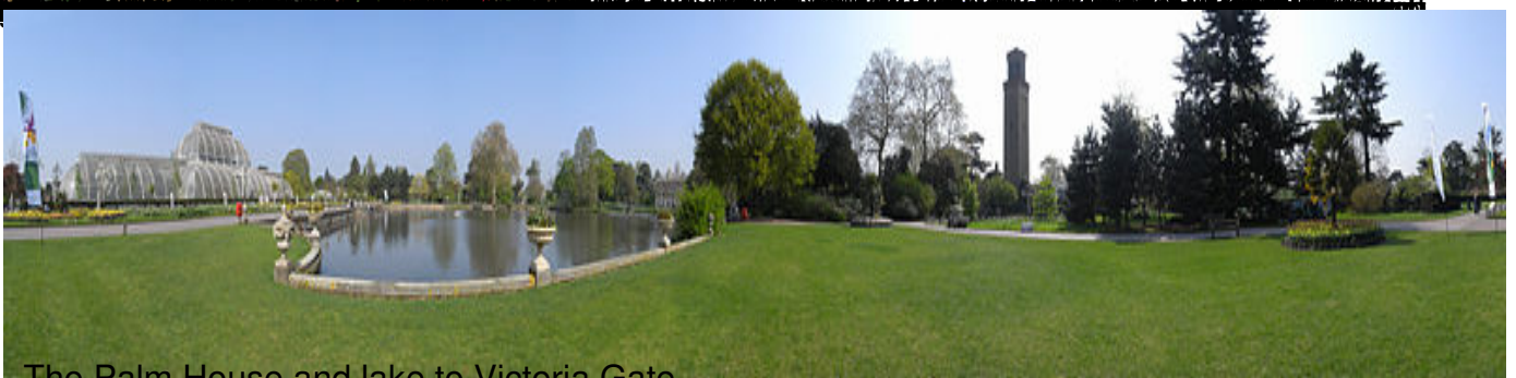
The Palm House and lake to Victoria Gate