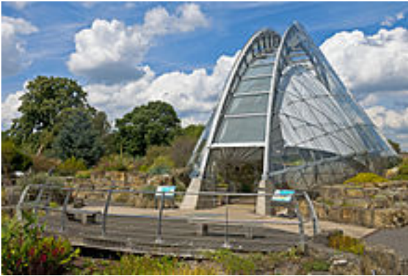
The Davies Alpine House in 2014

In March 2006, the Davies Alpine House opened, the third version of an alpine house since 1887. Although only 16 metres (52 ft) long the apex of the roof arch extends to a height of 10 metres (33 ft) in order to allow the natural airflow of a building of this shape to aid in the all-important ventilation required for the type of plants to be housed.