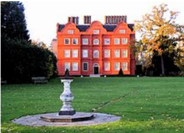
The Palace at Kew, with the sundial in the foreground

Kew Palace is the smallest of the British royal palaces. It was built by Samuel Fortrey , a Dutch merchant in around 1631. It was later purchased by George III. The construction method is known as Flemish bond and involves laying the bricks with long and short sides alternating. This and the gabled front give the construction a Dutch appearance.