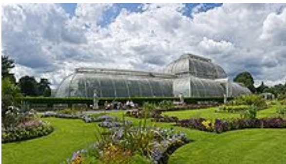
The Palm House and Parterre

The Palm House (1844–1848) was the result of cooperation between architect Decimus Burton and iron founder Richard Turner, [29] and continues upon the glass house design principles developed by John Claudius Loudon [30][31] and Joseph Paxton. [31] A space frame of wrought iron arches, held together by horizontal tubular structures containing long prestressed cables, [31] [32] supports glass panes which were originally [29] tinted green with copper oxide to reduce the significant heating effect. The 19m high central