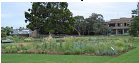
View of the Jodrell Laboratory across part of the grass collection

The Sustainable Uses of Plants group (formerly the Centre for Economic Botany ), focus on the uses of plants in the United Kingdom and the world's arid and semi-arid zones. The Centre is also responsible for curation of the Economic Botany Collection, which contains more than 90,000 botanical raw materials and ethnographic artefacts, some of which are on display in the Plants + People exhibit in Museum No. 1. The Centre is now located in the Jodrell Laboratory. [52]