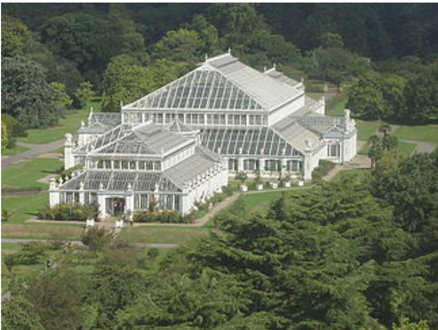
Kew Gardens Temperate House from the Pagoda