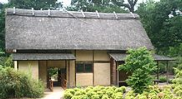
Queen Charlotte's Cottage

Saturday, 12 November 2016 22:46 - Last Updated Saturday, 12 November 2016 23:07