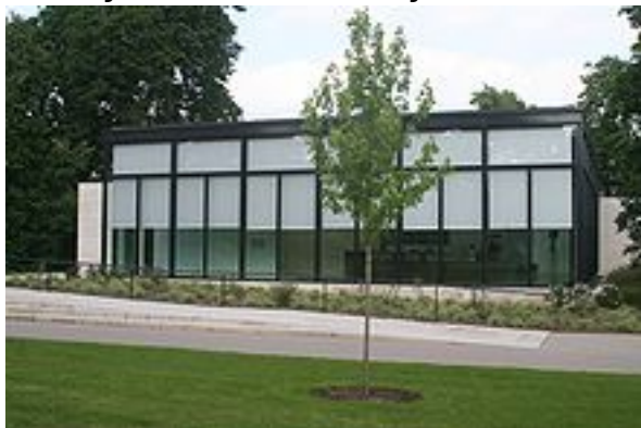
The Shirley Sherwood Gallery of Botanic Art