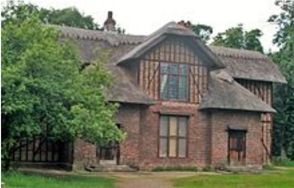
Queen Charlotte's Cottage

Within the conservation area is a cottage that was built sometime before 1771 for Queen Charlotte by her husband George III. It has been restored by Historic Royal Palaces and is separately administered by them. [41] It is open to the public on weekends and bank holidays during the summer.