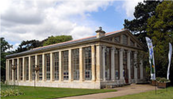
On the left is the Orangery, built to replace the original orangery destroyed by King William IV. The building was destroyed by fire in 1836.