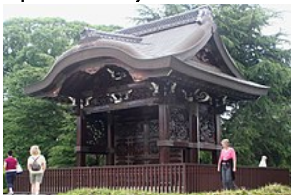
The Japanese Gateway (Chokushi-Mon)

Built for the Japan-British Exhibition (1910) and moved to Kew in 1911, the Chokushi-Mon ("Imperial Envoy's Gateway") is a four-fifths scale replica of the