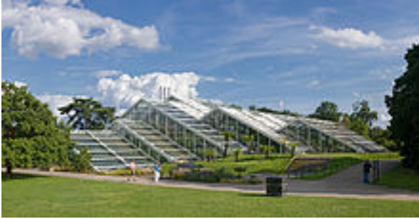
Princess of Wales Conservatory