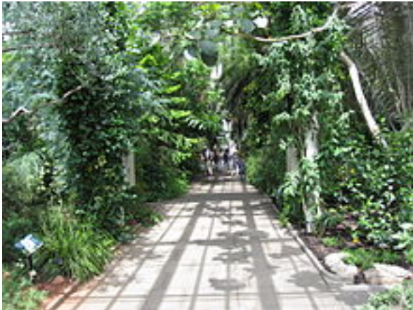
Inside the Temperate House

The Temperate House, currently closed for restoration, is a greenhouse that has twice the floor area of the Palm House and is the world's largest surviving Victorian glass structure. When in use it contained plants and trees from all the temperate regions of the world. It was commissioned in 1859 and designed by architect Decimus Burton and ironfounder Richard Turner. Covering 4880 square metres, it rises to a height of 19 metres. Intended to accommodate Kew's expanding collection of hardy and temperate plants, it took 40 years to construct, during which time costs soared. The building was restored during 2014 - 15 by Donald Insall Associates, based on their conservation management plan. [36]